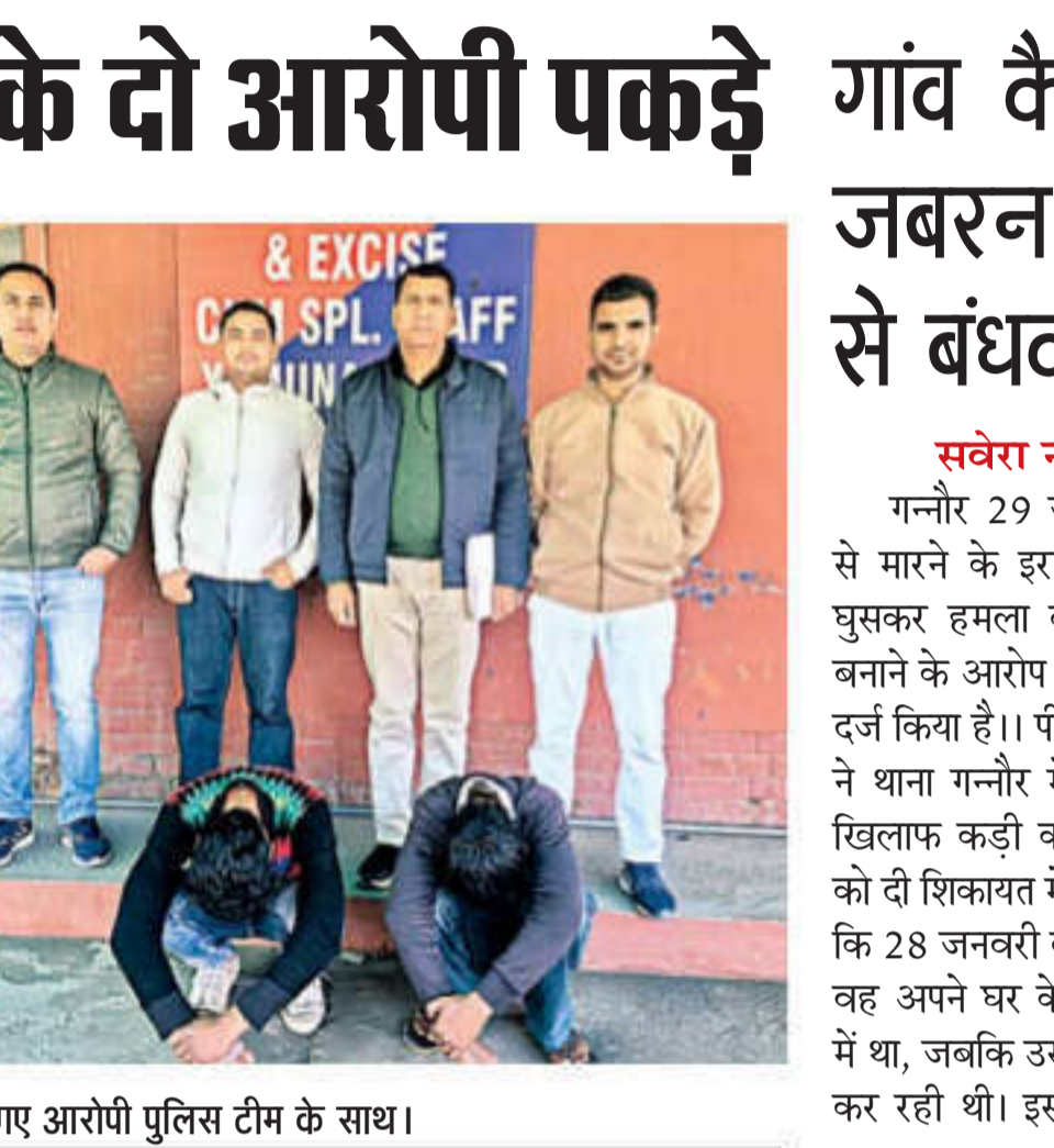
पकड़े गए आरोपी पुलिस टीम के साथ।

जैसे प्रधानमंत्री किसान सम्मान निधि, राष्ट्रीय कृषि विकास योजना, प्राकृतिक खेती एवं सूक्ष्म सिंचाई (इटडर) आदि के लाभों पर भी चर्चा करेंगे, ताकि अधिक से अधिक किसान इन योजनाओं से जुड़ सकें। किसान मेलों में भाग लेंगे, कृषि व ग्रामीण विकास योजनाओं का संदेश देंगे दोपहर 12 बजे के बाद चौहान गांव खपरी से निकलकर 12.30 बजे दुर्ग जिले के कुम्हारी पहुंचेंगे, जहां वे छत्तीसगढ़ यूथ प्रोग्रेसिव फार्मर्स एसोसिएशन द्वारा आयोजित किसान मेलों में शामिल होंगे। दोपहर 12.30 से 1.30 बजे तक चलने वाले इस कार्यक्रम में वे आधुनिक कृषि तकनीकों, फसल विविधीकरण, किसान उत्पादक संगठनों (ऋड), डिजिटल एग्रीकल्चर और ग्रामीण आजीविका मिशन के माध्यम से किसानों की आय बढ़ाने के रोडमैप पर अपने विचार रखेंगे।